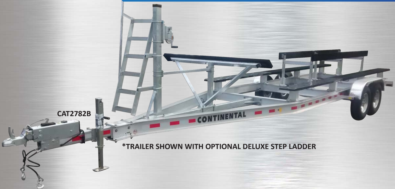
*TRAILER SHOWN WITH OPTIONAL DELUXE STEP LADDER