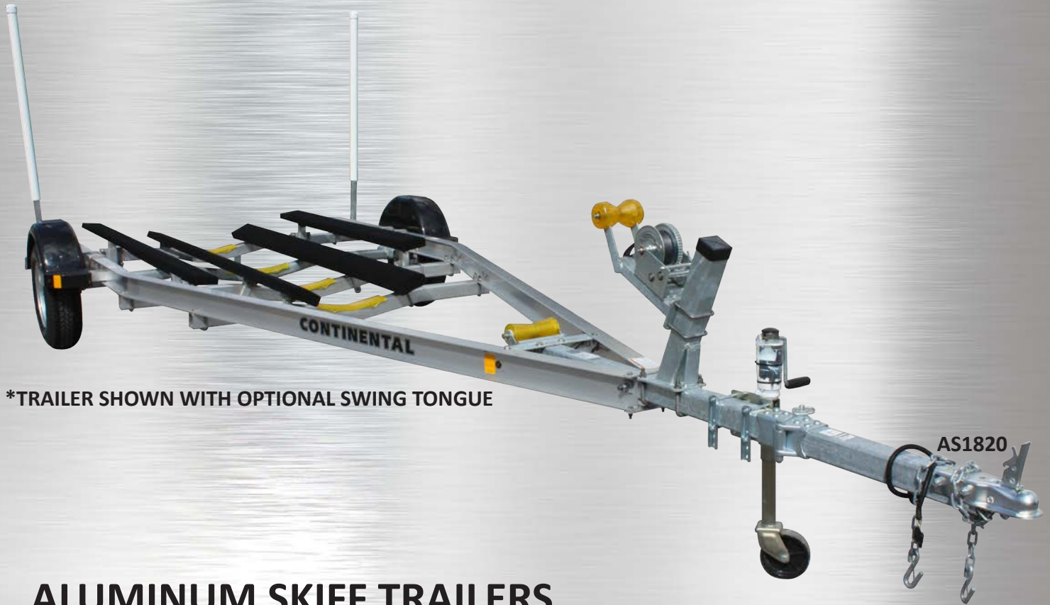
*TRAILER SHOWN WITH OPTIONAL SWING TONGUE