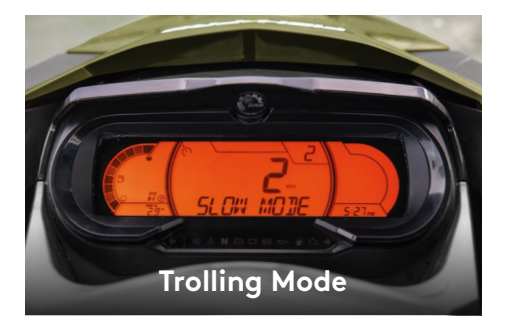
Gives superior trolling control at low speeds without using the throttle - simply set, maintain and adjust as needed.

A spacious, quick-attach fishing cooler designed for easy access and equipped with numerous convenient features.