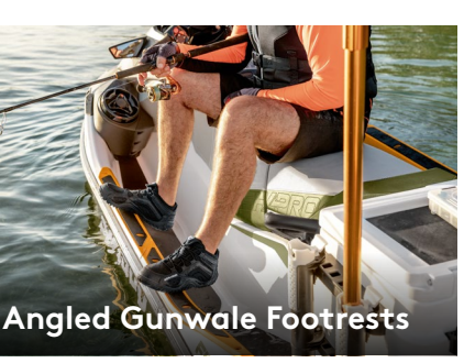
and secure while fishing from a side position.

watercraft, and for better comfort and stability when