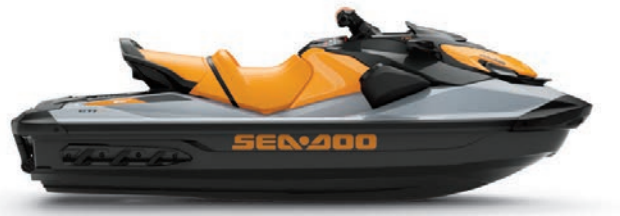
GTI™ SE 170