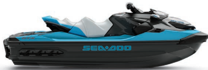
Beach Blue Metallic & Lava Gray (GTX 170 only)